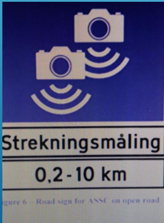
Figure 6 - Road sign for ASSC on open road