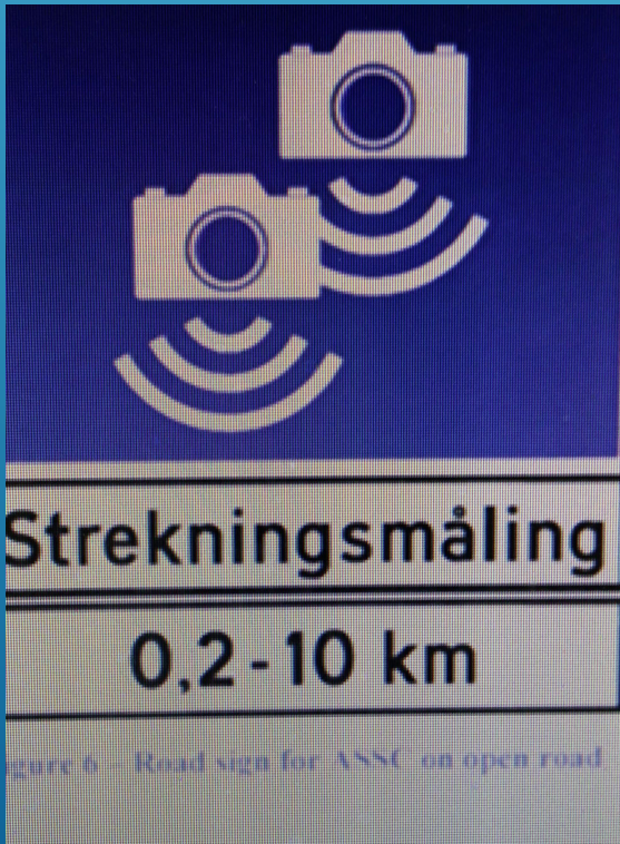
Figure 6 - Road sign for SSC on open road