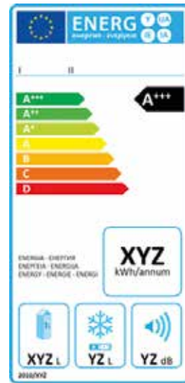
Example of EU Energy label for a refrigerator

To date the most efficient conventional refrigerators are rated A+++ and can realize energy savings of about 60 % compared to the efficiency class A.