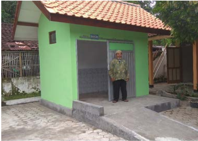
School toilet