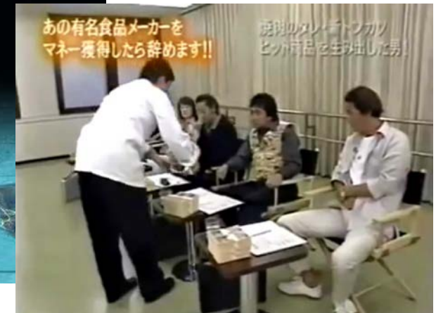
“Money Tigers” - Japan