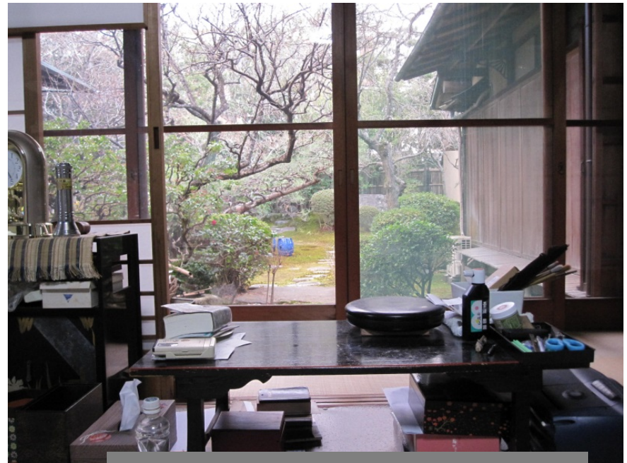
Former Residence of Hideki Yukawa