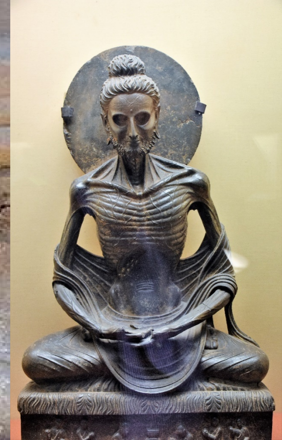
Barmula (1700 years old)