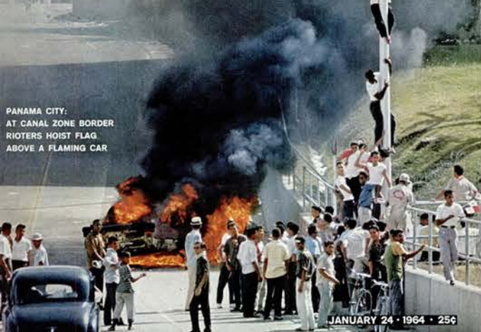
PANAMA CITY: AT CANAL ZONE BORDER RIOTERS HOIST FLAG ABOVE A FLAMING CAR