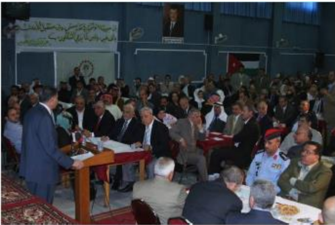
Figure A.19 First Public Forum presentation