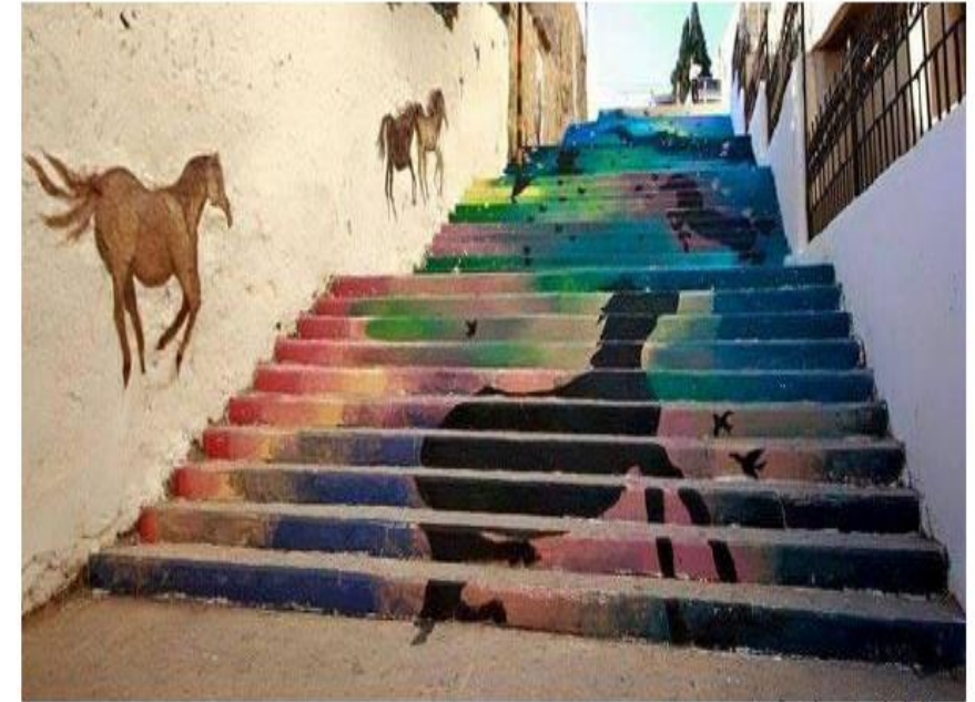
«سالم السلام» في وسط مدينة إربد تطوير وسط مدينة إربد