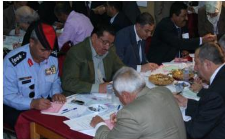
Figure A.20 First Public Forum survey