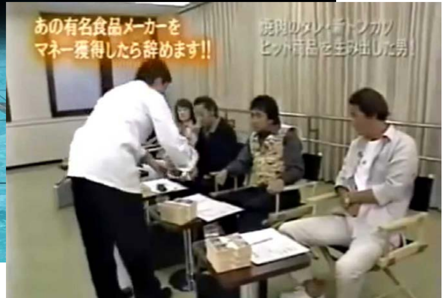
“Money Tigers” - Japan