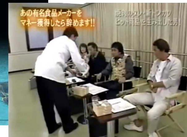
“Money Tigers” - Japan