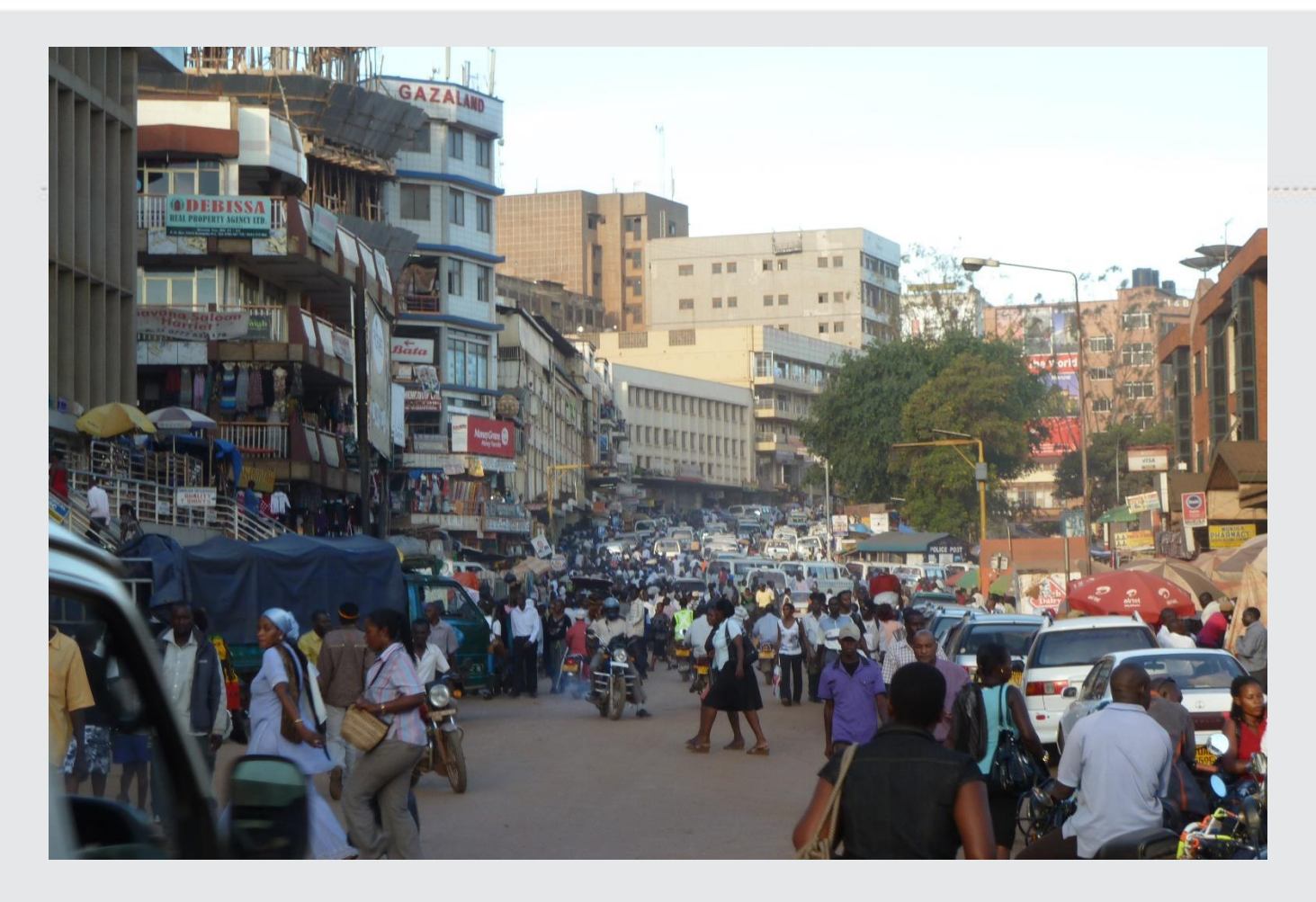
Stick to the plan! Reward will come in the Smart Moving Kampala