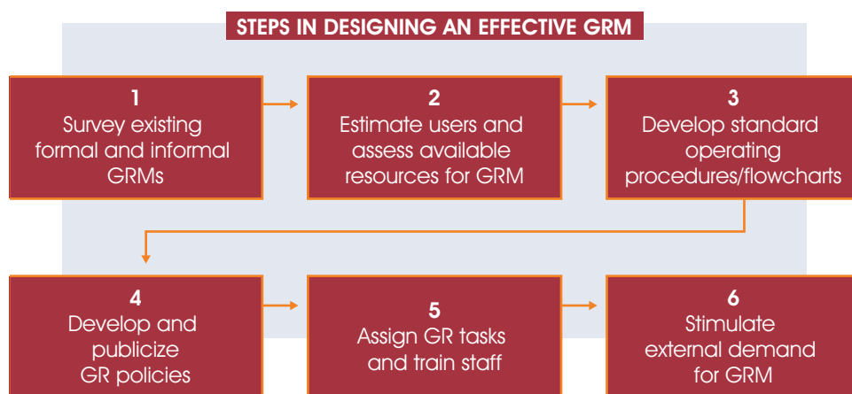
FIGURE 2 Six Steps in Designing an Effective GRM