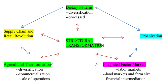
Fig. 1. Integrating the transformations of five key components of the agri-food system.

investment funding would be both stillborn but for the supply response—supply of supply-chain and rural services (like credit and water) in the factor markets, and of farm output.